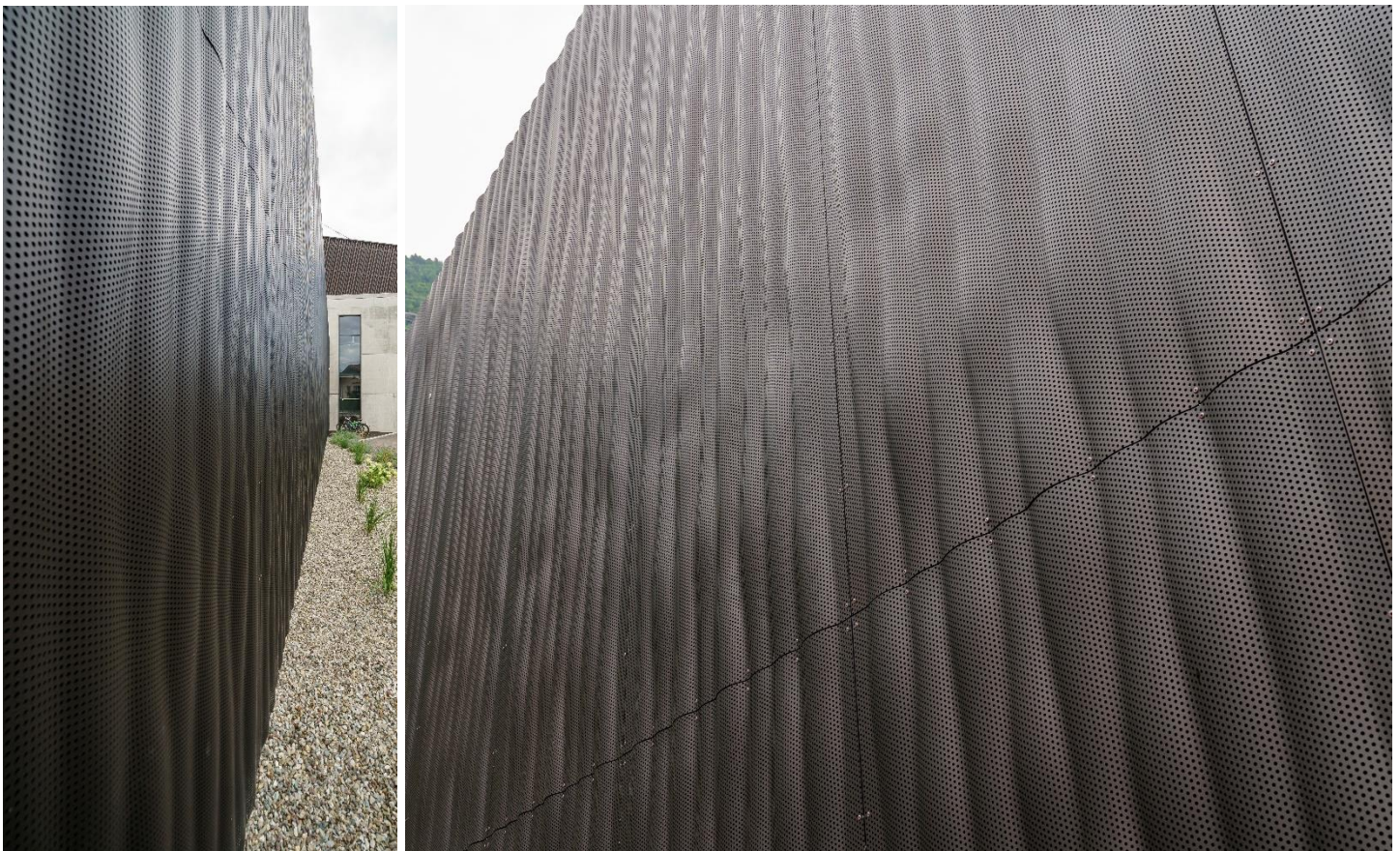
Seilbahn Vöran, Italy | architecture & design: Studio Willeit Niederstätter Architects